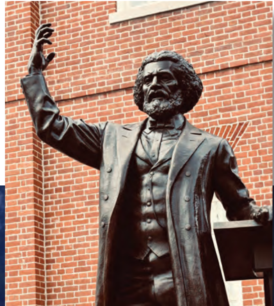
Above Right: Statue of Frederick Douglass in Easton, MD.

The Maryland Department of Transportation (MDOT) in partnership with the Federal Highway Administration (FHWA) is launching a project in Spring 2025 to design a 10-mile section of the proposed Frederick Douglass Rail-Trail between Tuckahoe State Park and Black Dog Alley near Easton, MD.